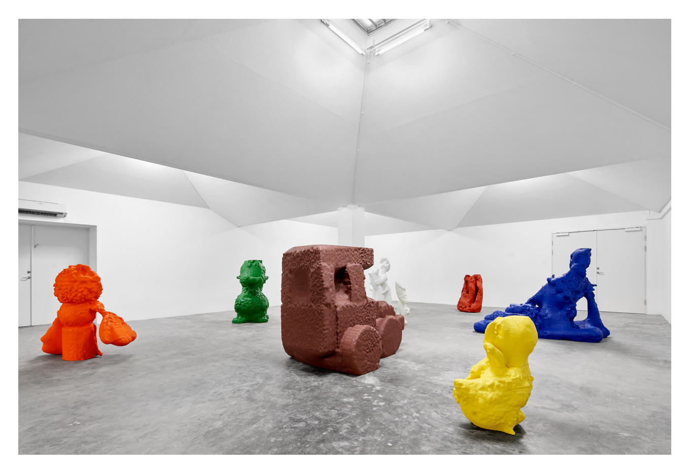
Mads Lindberg. Sclupture 3D. SIMIAN. February - April, 2022.