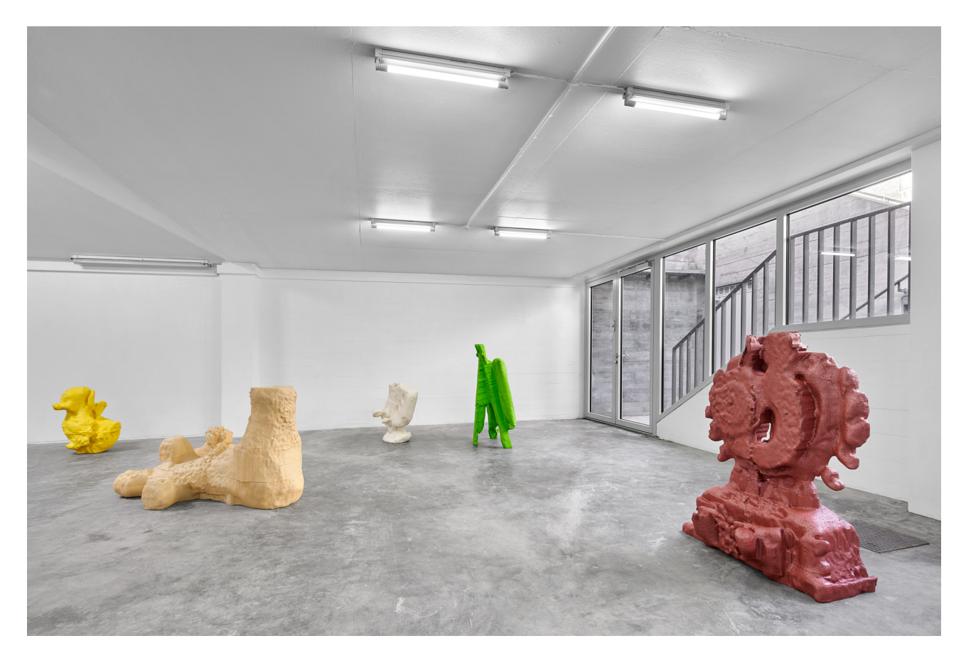
Mads Lindberg. Sclupture 3D. SIMIAN. February - April, 2022.