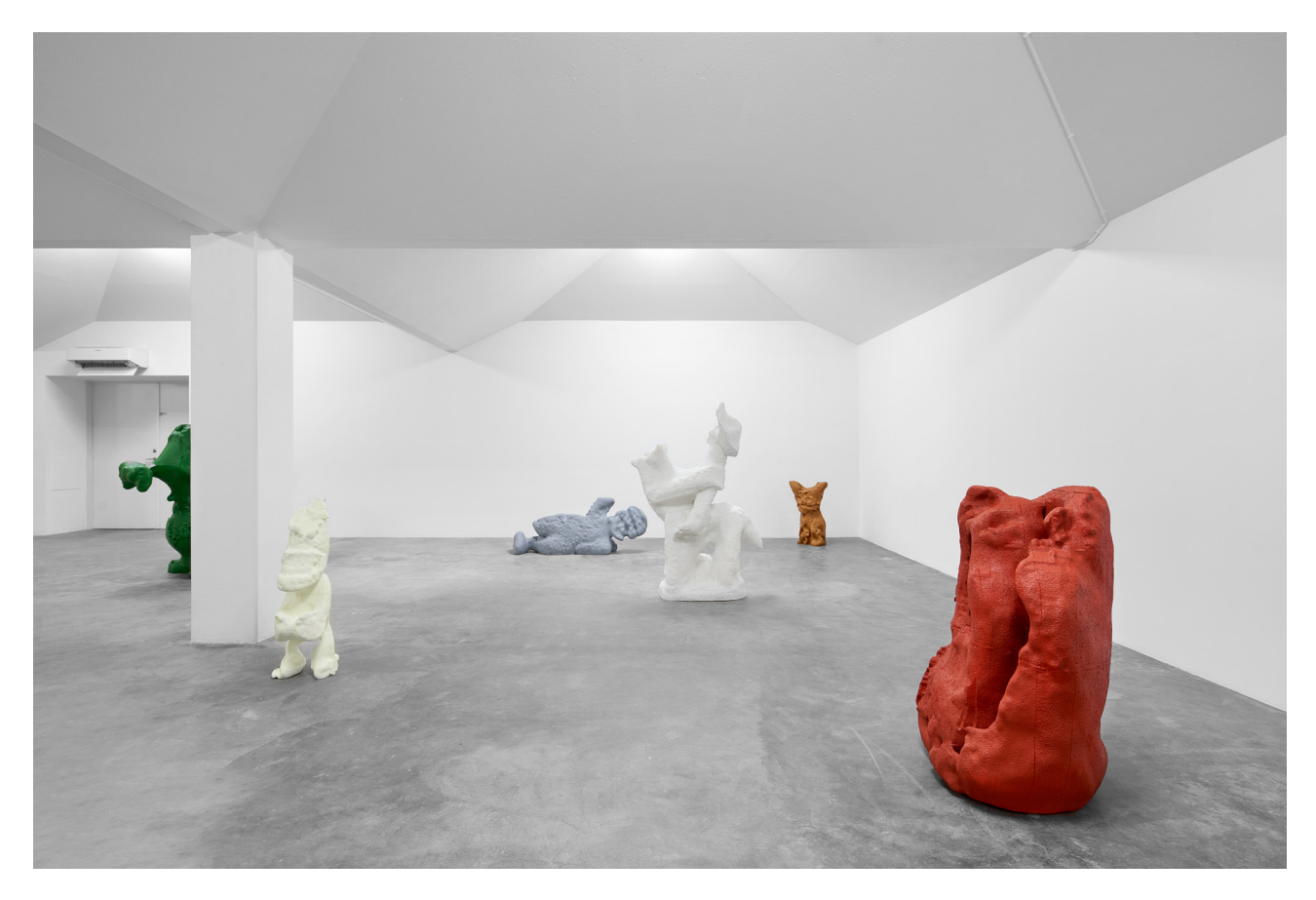
Mads Lindberg. Sclupture 3D. SIMIAN. February - April, 2022.