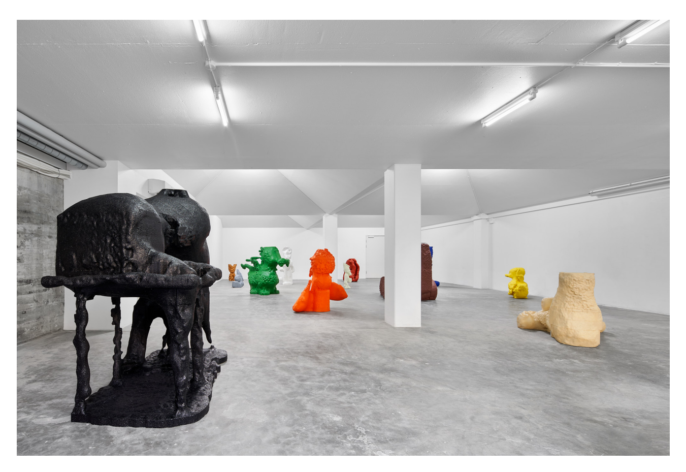
Mads Lindberg. Sclupture 3D. SIMIAN. February - April, 2022.