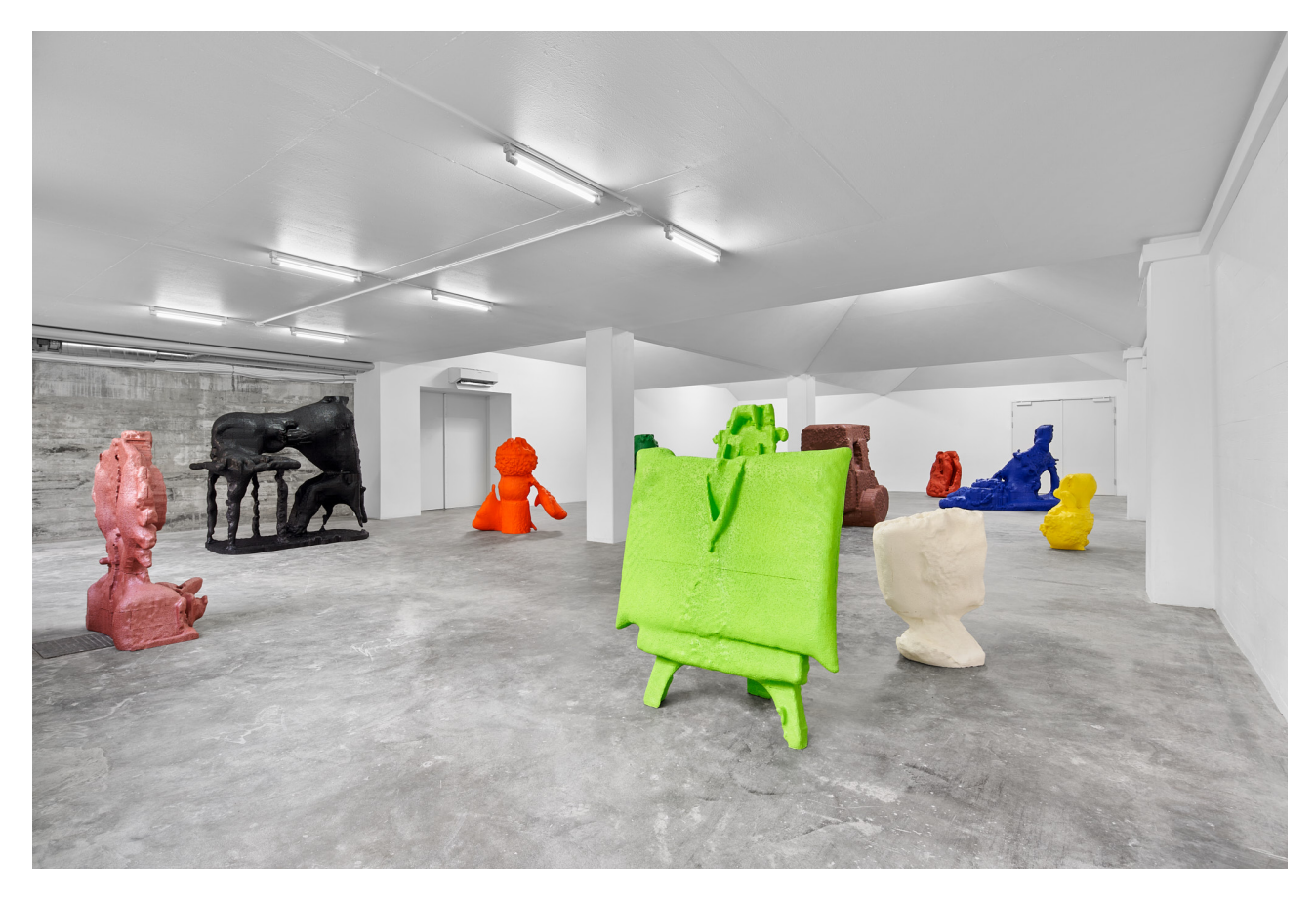
Mads Lindberg. Sclupture 3D. SIMIAN. February - April, 2022.