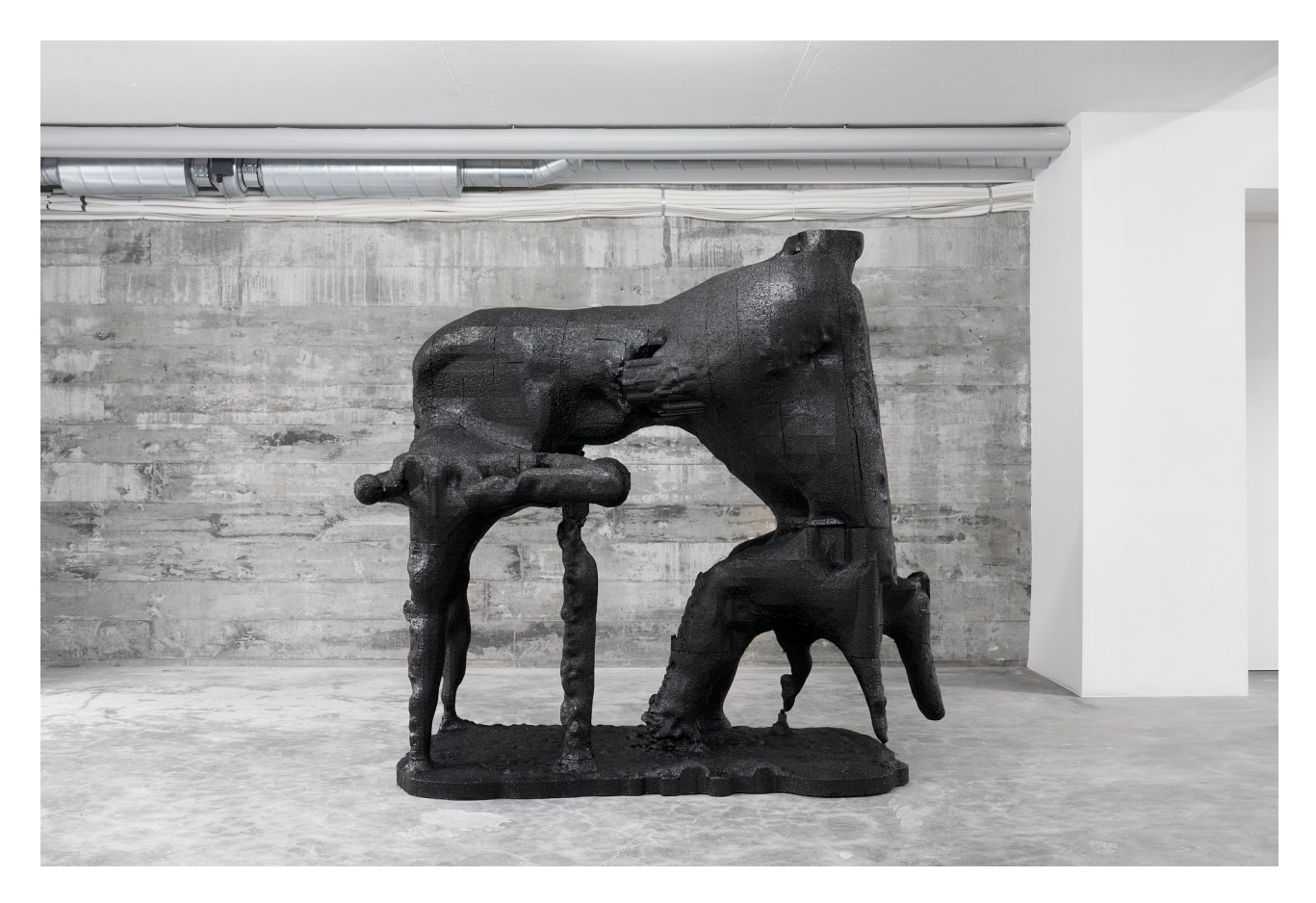
Untitled (Profession / Fixing the Radio), 2022 Styrofoam, PU foam, wood glue and acrylic paint 170 x 105 x 178 cm