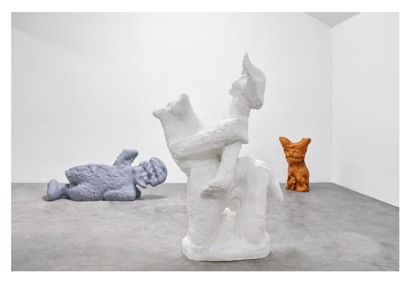
Mads Lindberg. Sclupture 3D. SIMIAN. February - April, 2022.