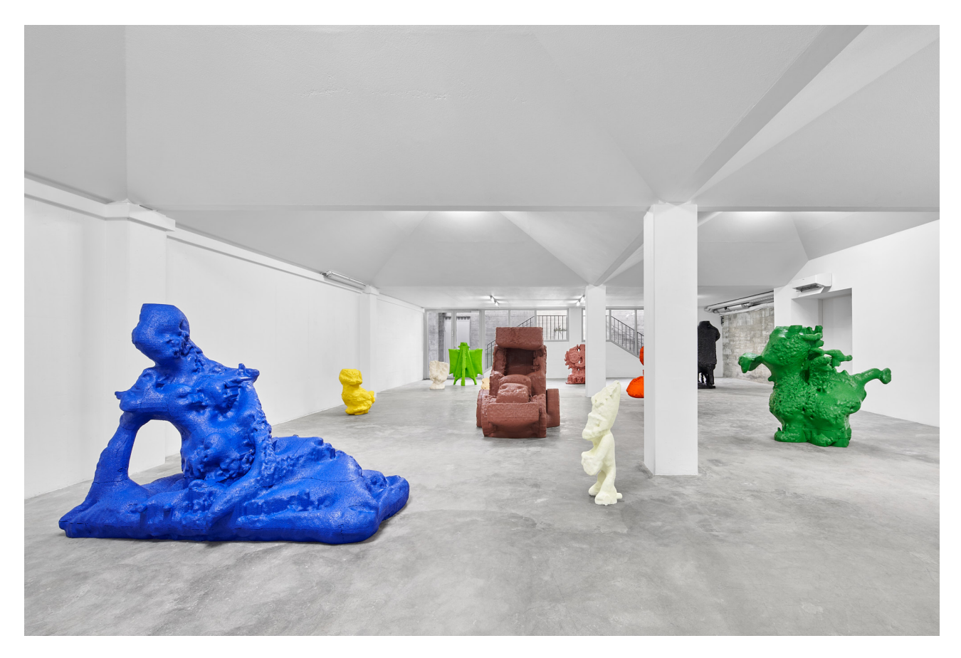
Mads Lindberg. Sclupture 3D. SIMIAN. February - April, 2022.