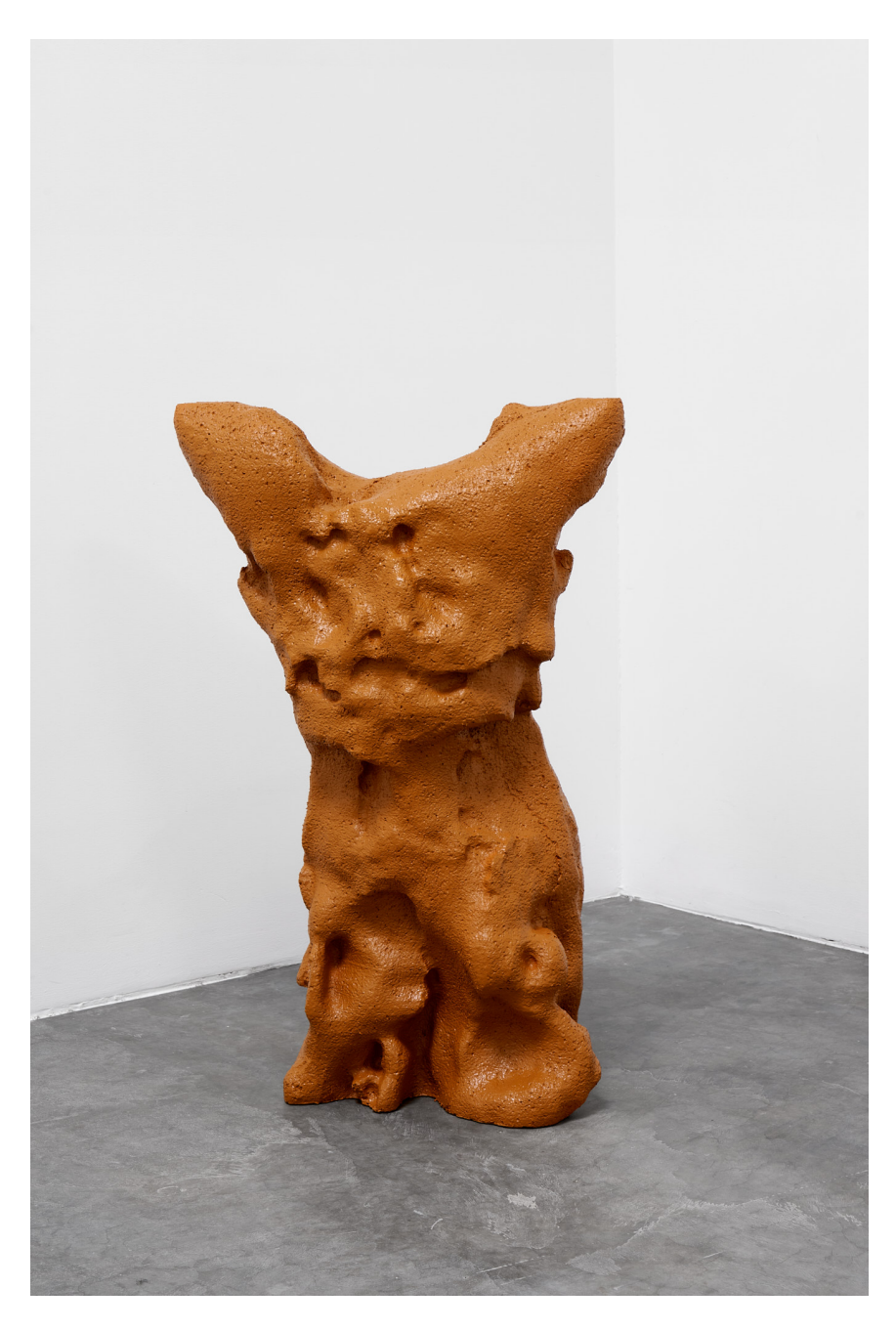
Untitled (Monster) , 2022 Styrofoam, PU foam, wood glue and acrylic paint 78 x 49 x 29 cm