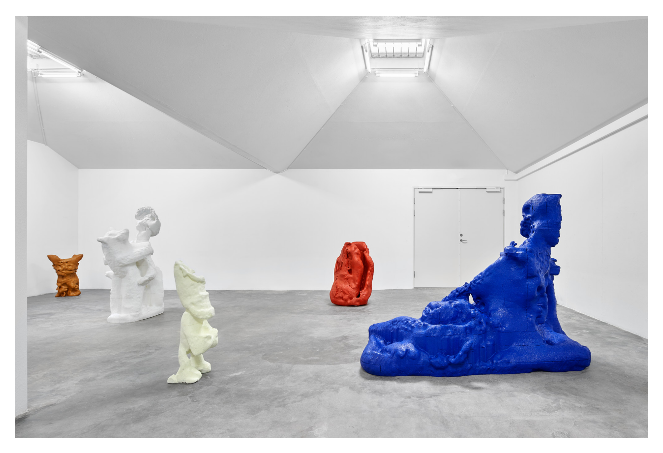
Mads Lindberg. Sclupture 3D. SIMIAN. February - April, 2022.