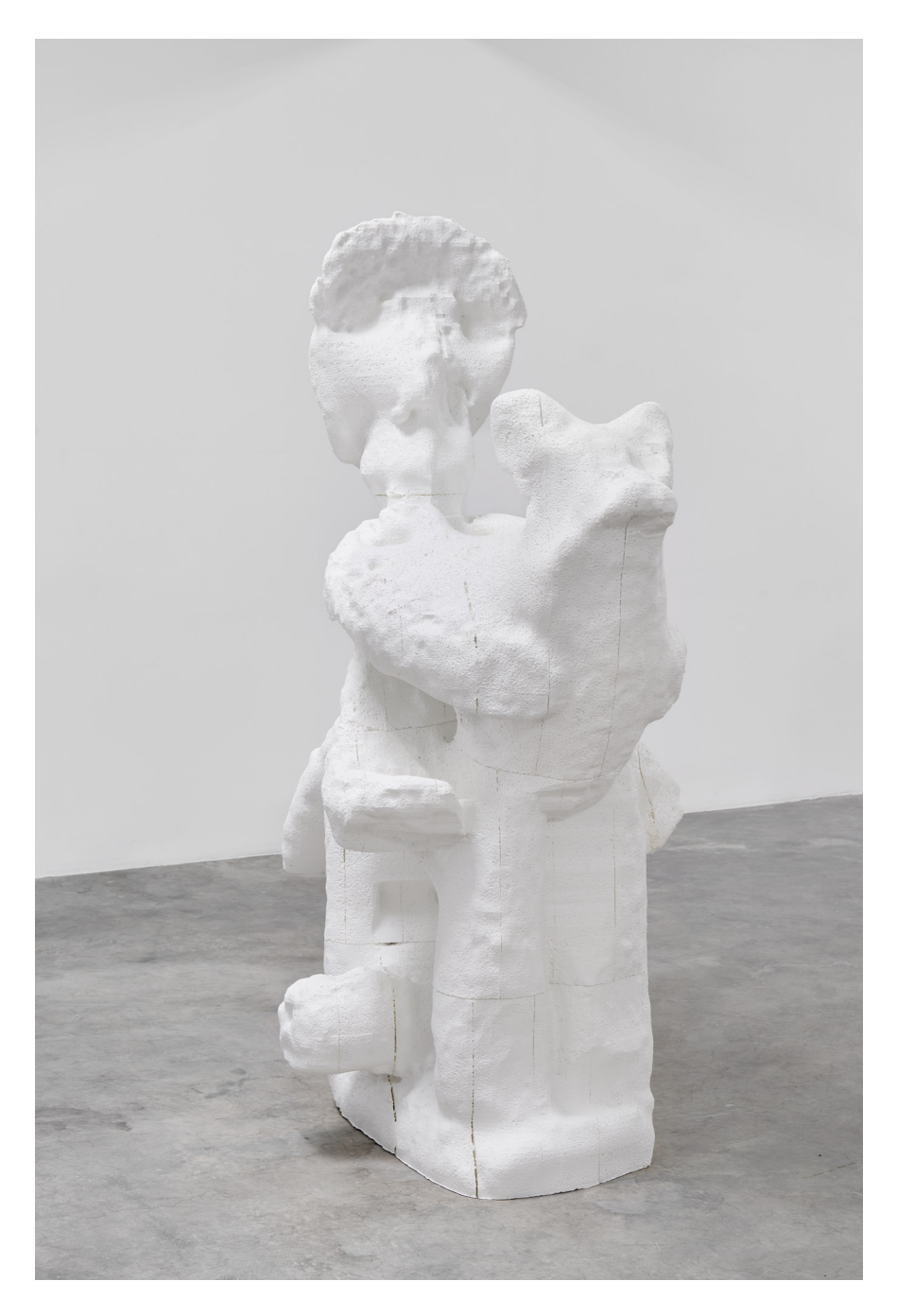
Untitled (Mallorcan Mystery) , 2022 Styrofoam, PU foam, wood glue and acrylic paint 160 x 106 x 68 cm