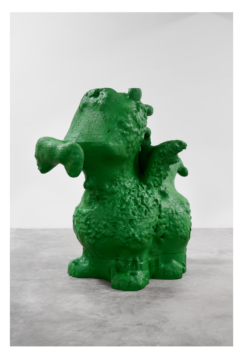
Untitled (Puff) , 2022 Styrofoam, PU foam, wood glue and acrylic paint 136 x 80 x 155 cm