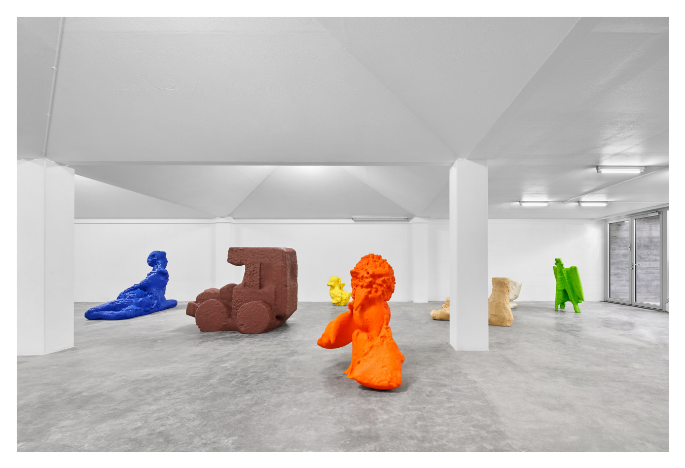
Mads Lindberg. Sclupture 3D. SIMIAN. February - April, 2022.