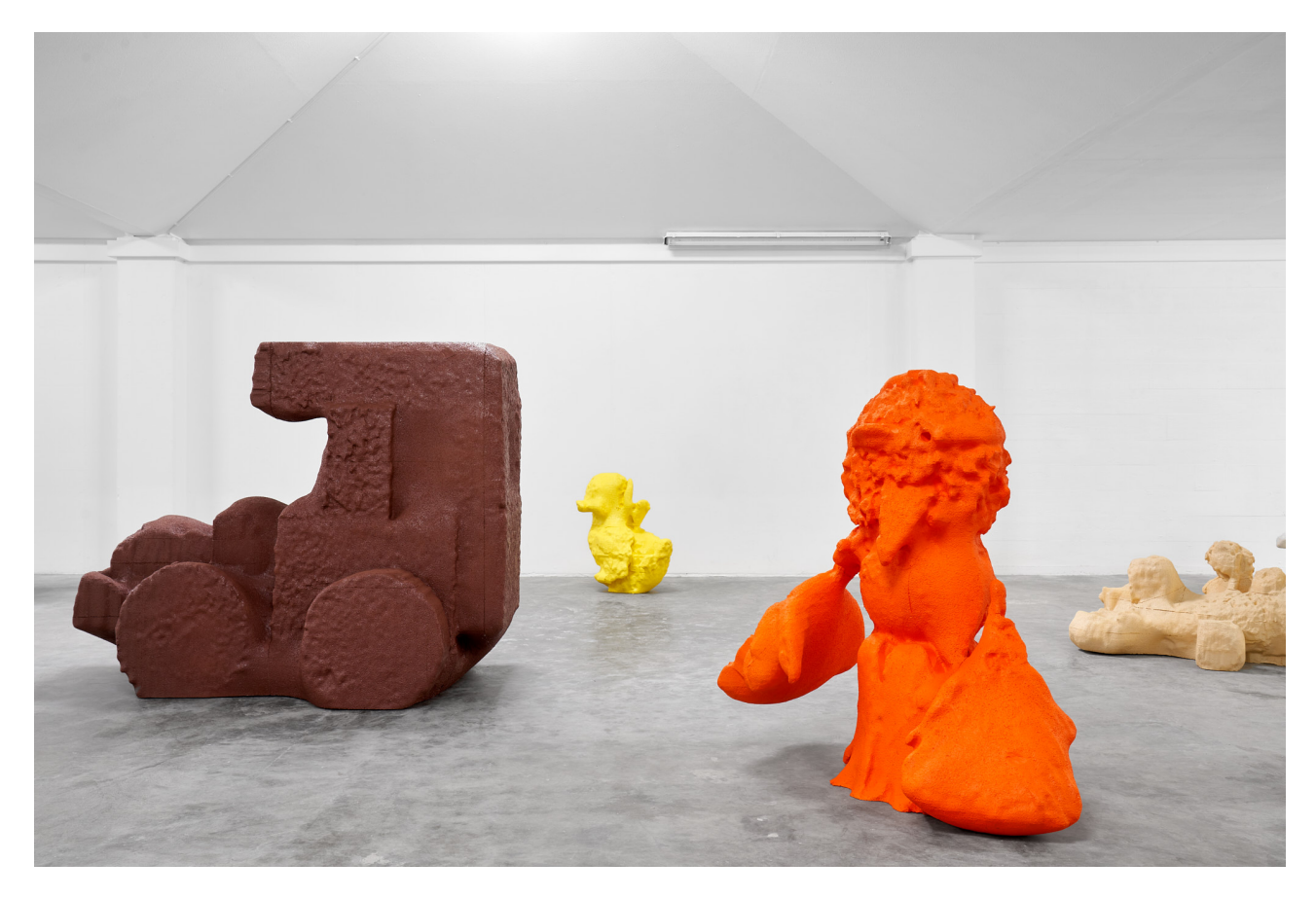
Mads Lindberg. Sclupture 3D. SIMIAN. February - April, 2022.