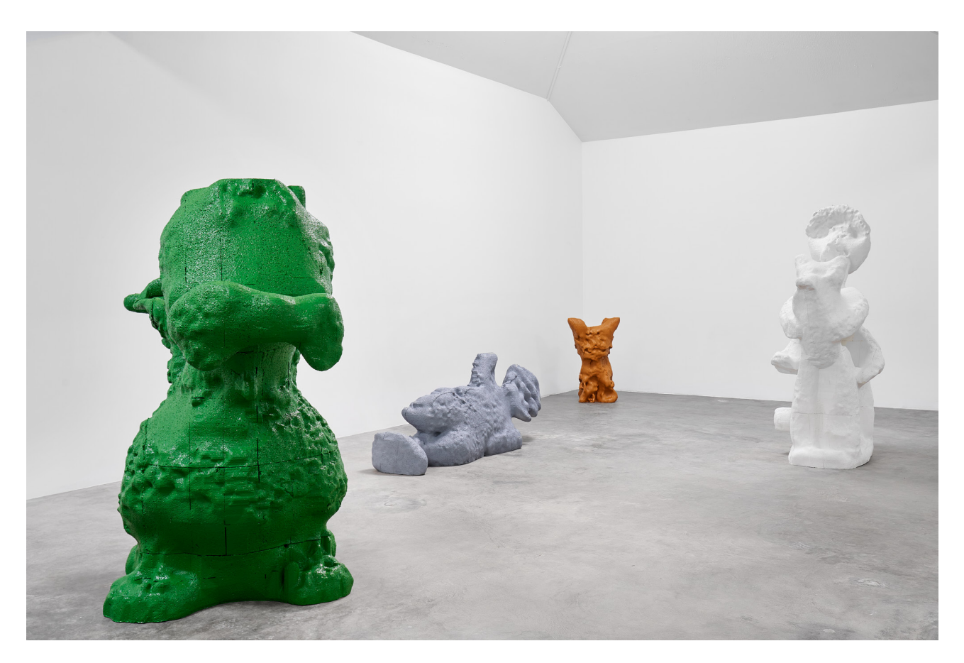
Mads Lindberg. Sclupture 3D. SIMIAN. February - April, 2022.