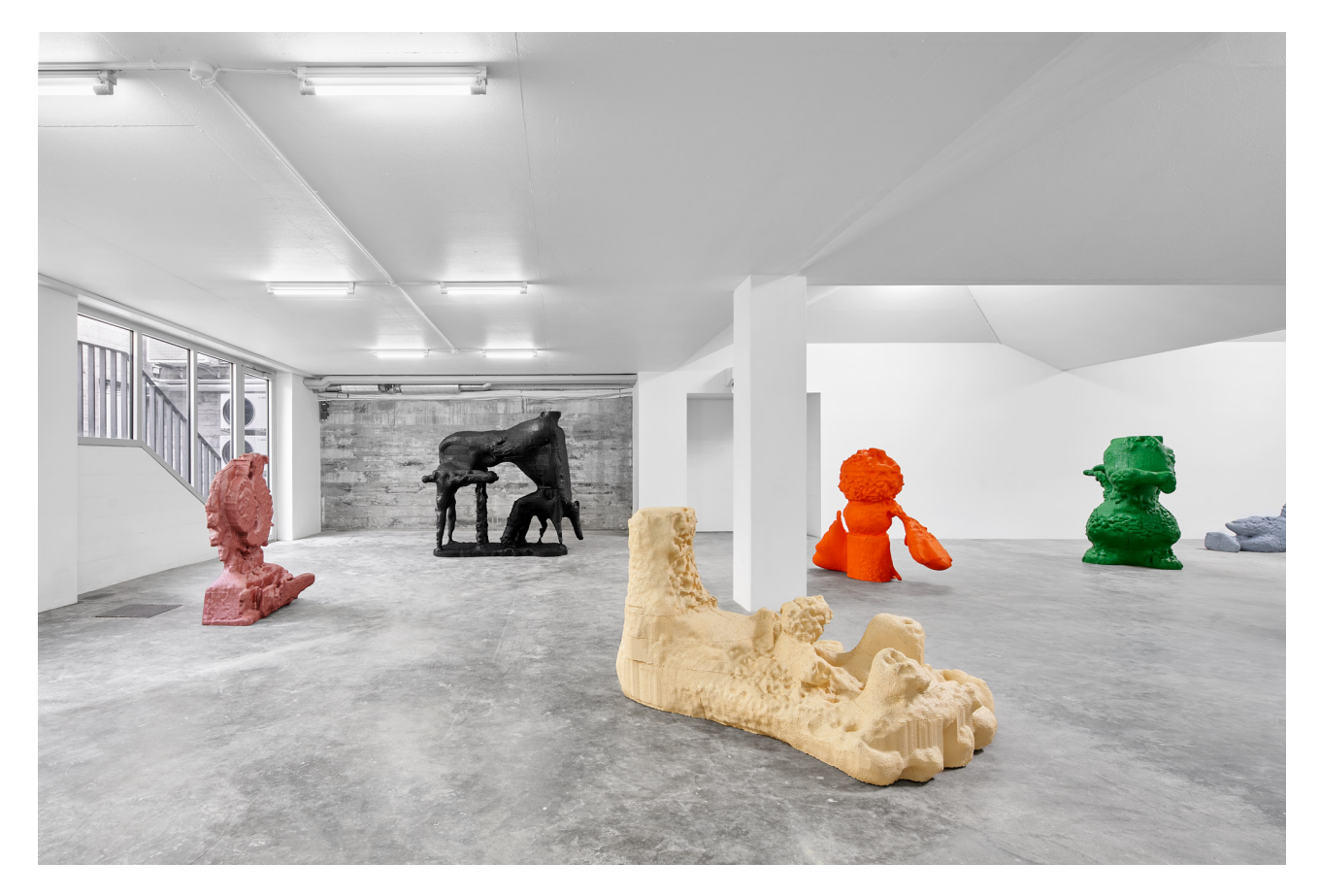
Mads Lindberg. Sclupture 3D. SIMIAN. February - April, 2022.