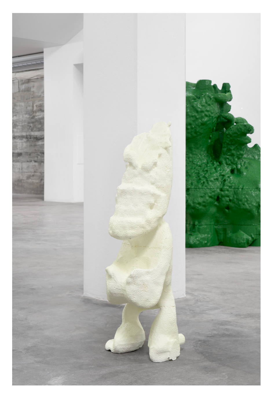
Untitled (Tupilaq) , 2022 Styrofoam, PU foam, wood glue and acrylic paint 91 x 28 x 28 cm.