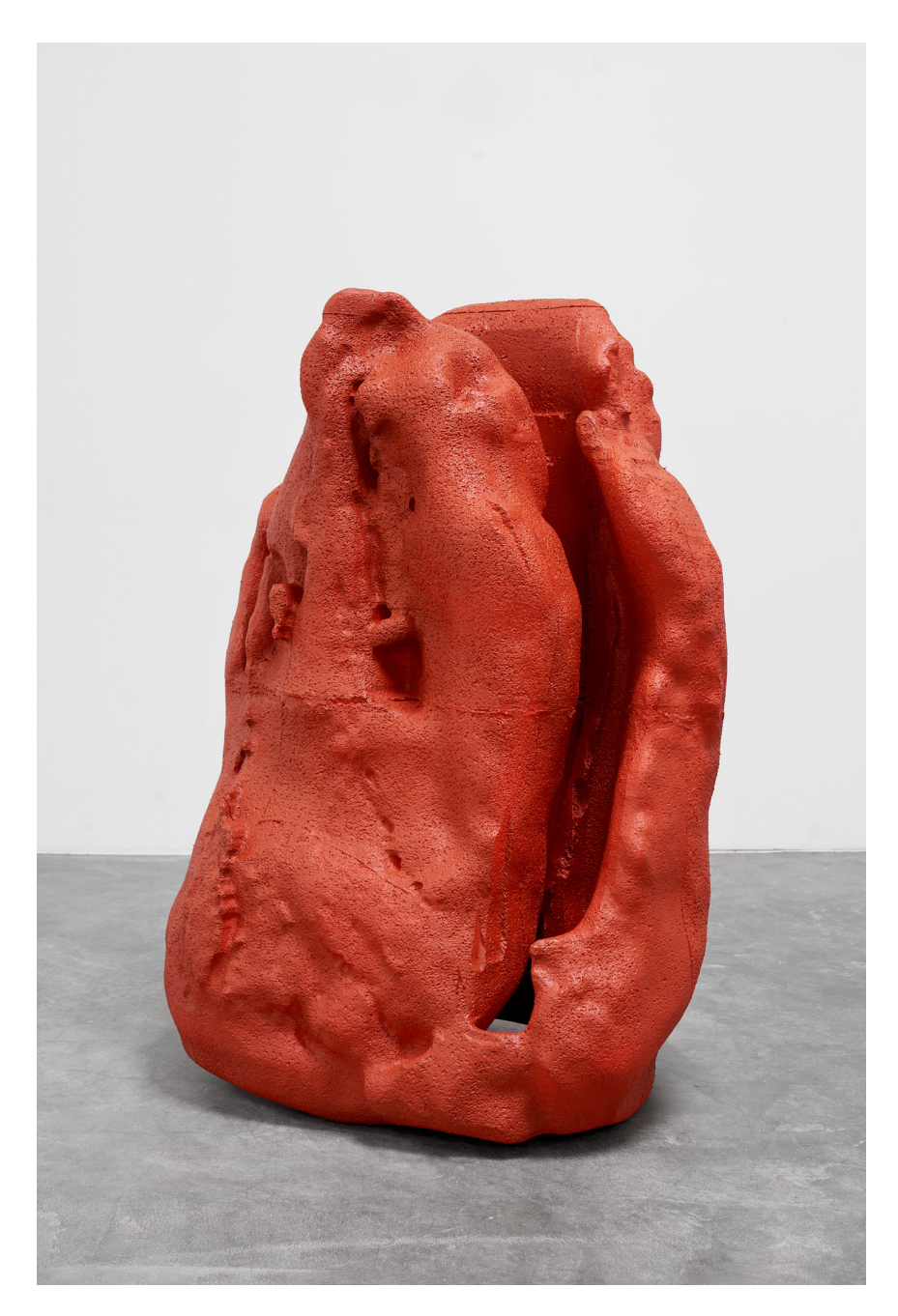
Untitled (A.G.) , 2022 Styrofoam, PU foam, wood glue and acrylic paint 102 x 68 x 63 cm