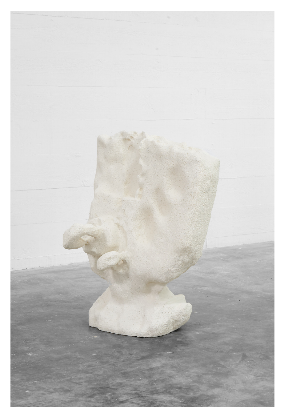
Untitled (Louisiana), 2022 Styrofoam, PU foam, wood glue and acrylic paint 76 x 54 x 45 cm