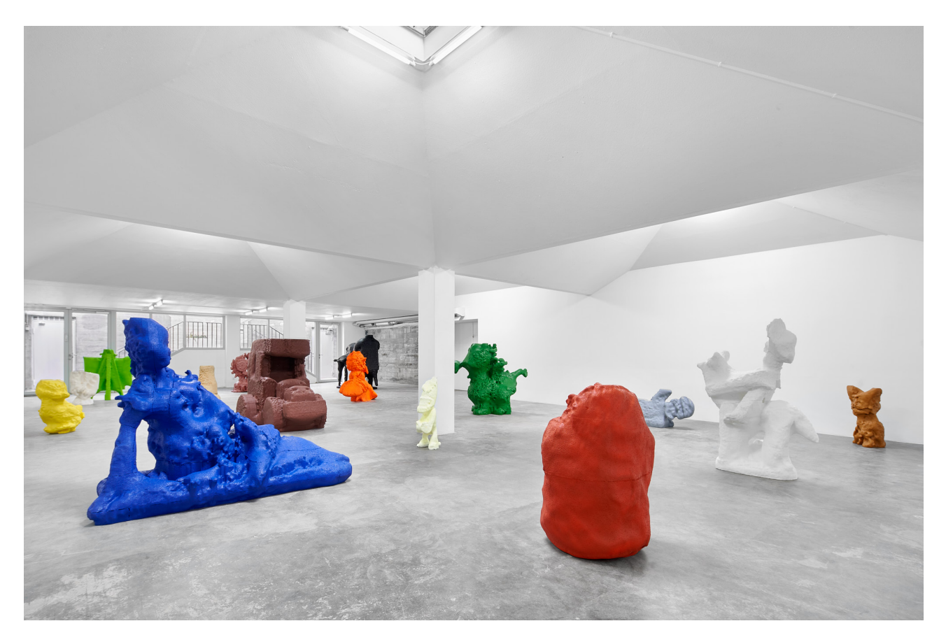
Mads Lindberg. Sclupture 3D. SIMIAN. February - April, 2022.