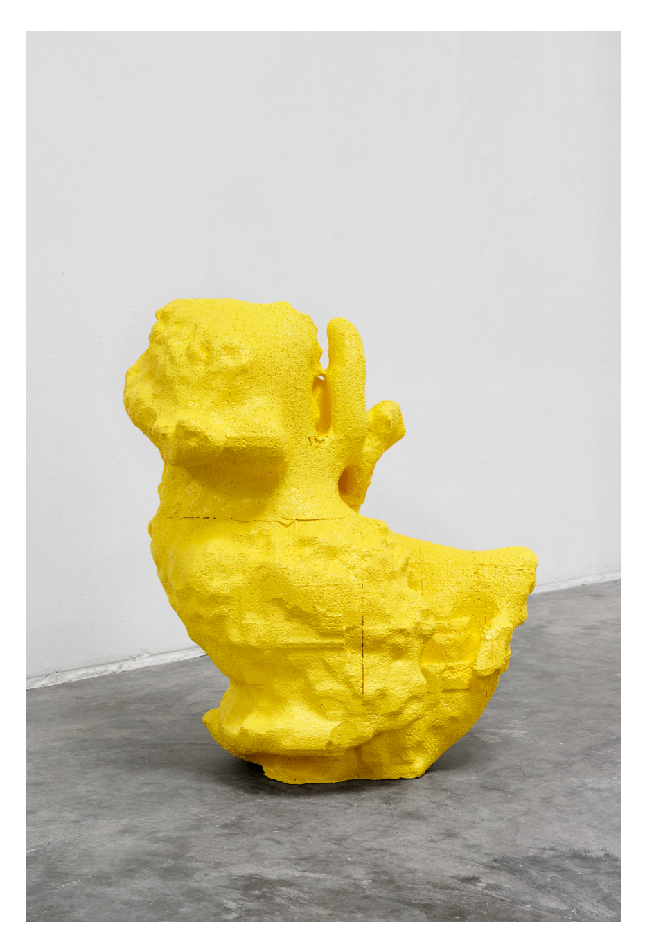
Untitled (Duck) , 2022 Styrofoam, PU foam, wood glue and acrylic paint 80 x 65 x 43 cm